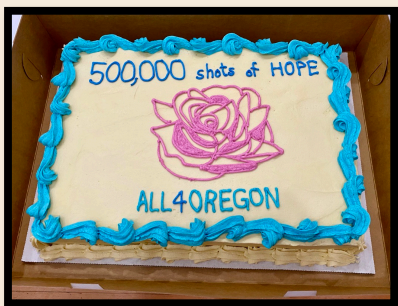
Sheet cake commissioned for the Oregon Convention Center COVID-19 vaccination team to celebrate 500,000 vaccines administered (May, 2021)